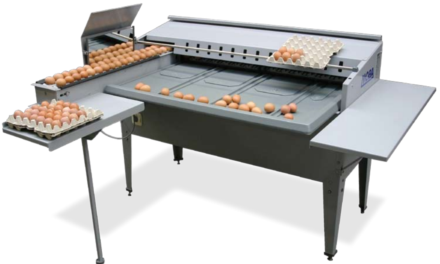
Moba 68 / Moba 88